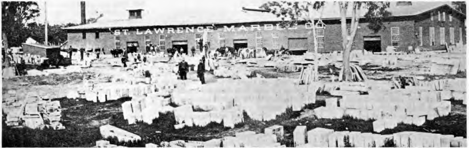
The cutting mill.