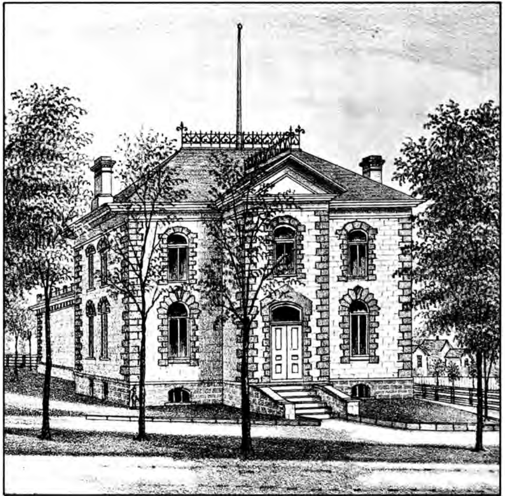
Sketch of old County Clerk's office, on corner of Court and Judson Streets in Canton, as it appeared in Evert's 1878 history of the County. It was constructed of Gouverneur marble.

The number of people that remember the once great marble industry has greatly decreased over the years. The industry was so famous by the end of the nineteenth century that no one thought about writing down the history of events to preserve it for future generations. The uniqueness of Gouverneur marble was